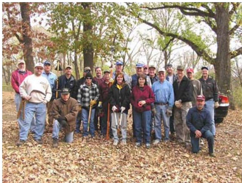
This group really got after it at the Harnage Cemetery.