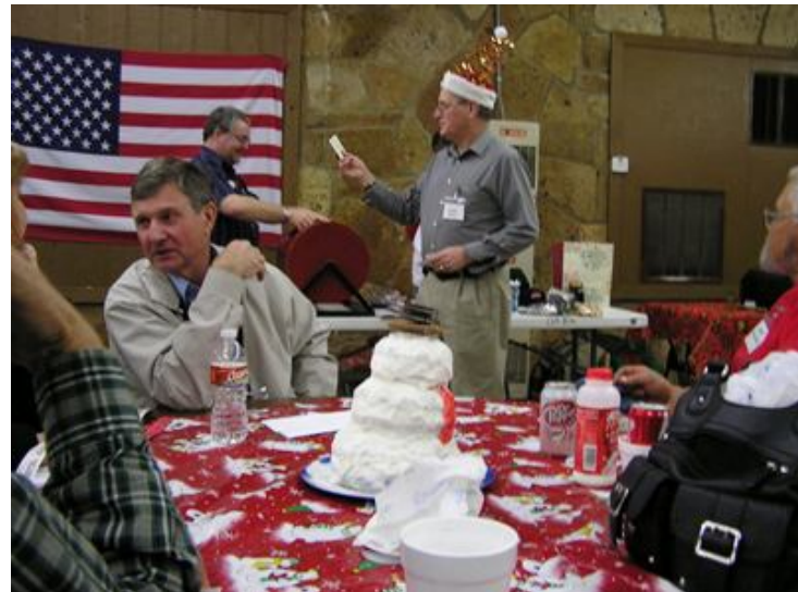
At the Christmas Party.