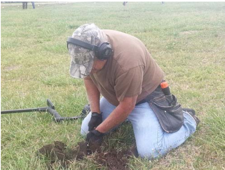
In a hole at the Deep Hunt!