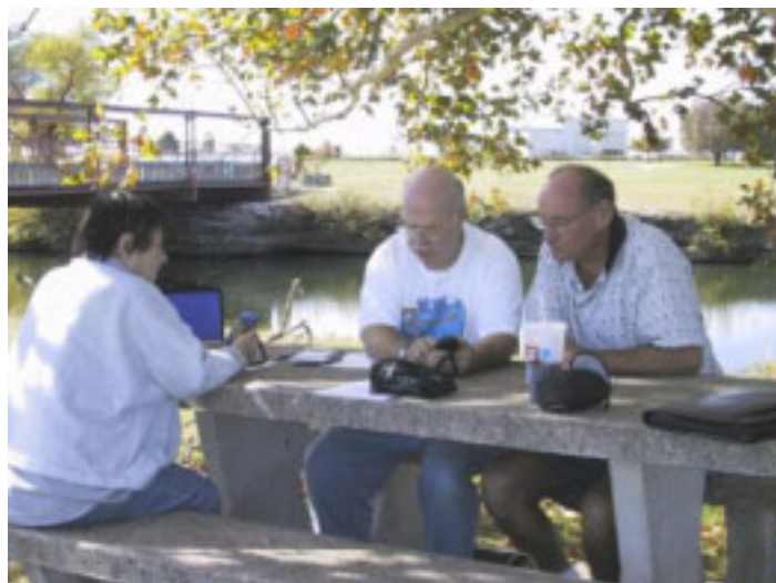
Learning about GPS Receivers at the October GPS Class