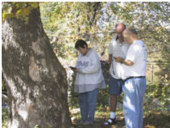
Entering hidden coordinates into GPS Receivers