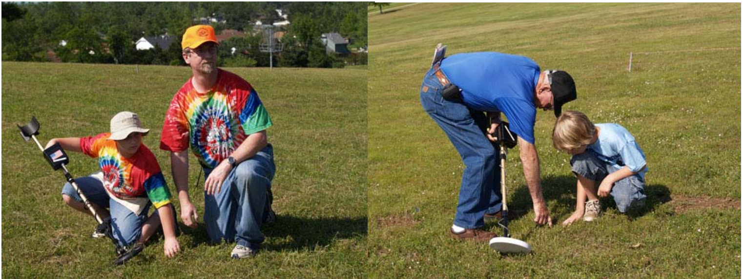
A couple of pics from our 2007 Hunt.