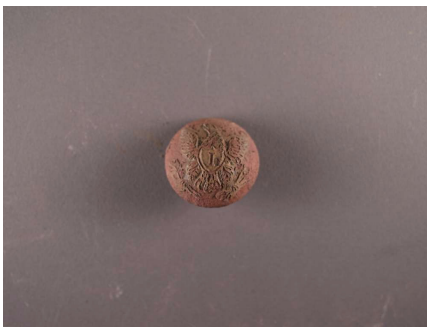
Chuck Marcum found this nice Infantry Button