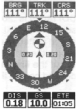
One of the Navigation Screens