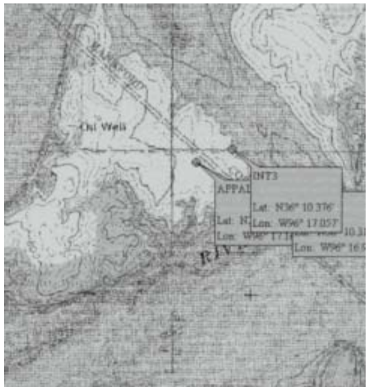
New Map with the Waypoints & Coordinates downloaded to it.

I will be updating this article real soon. I now have the newest Lowrance Receiver the iFinder with 128mb capability. There is also new GPS and Map Software out now with map calibration and map overlaying programs.