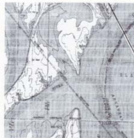
1981 7.5 Minute USGS Quadrangle Map