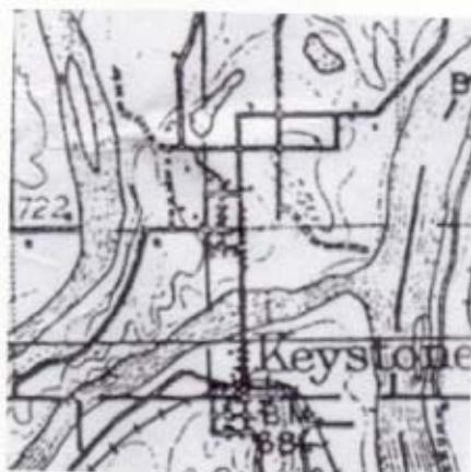
1915 30 Minute USGS Quadrangle Map

to do is to get all the old maps you can get pertaining to your site. Next you need to transfer the site from the old map onto the new map. You can do that in a number of different ways, by eyeballing it, by making an overlay, or by scaling it off of the section lines. After you have it on the new map you have to get coordinates to it. There are different coordinates you can use such as latitude and longitude, UTM, or military grid. I'm more familiar with latitude and longitude. With Delorme you can stop the cursor right on your site that you put on the new map and the latitude and longitude will show for that position. Next you need to enter the latitude and longitude into your GPS. Now your map work is done all you have to do is follow your GPS right to your site. One thing to remember is that your original source has to be accurate. The GPS will take you to the spot you put on the new map. We had an outing awhile back to a Mission we used one old map as a source. We plotted it on a new map followed the GPS to the position but the site wasn't